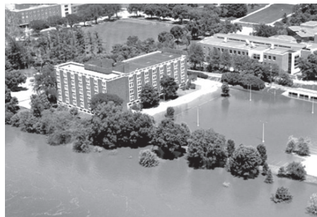
An aerial view of flooding on the University of Iowa Campus.

If you know of other flood resources we have not listed, please contact Iowa COMPASS so we can update our website.